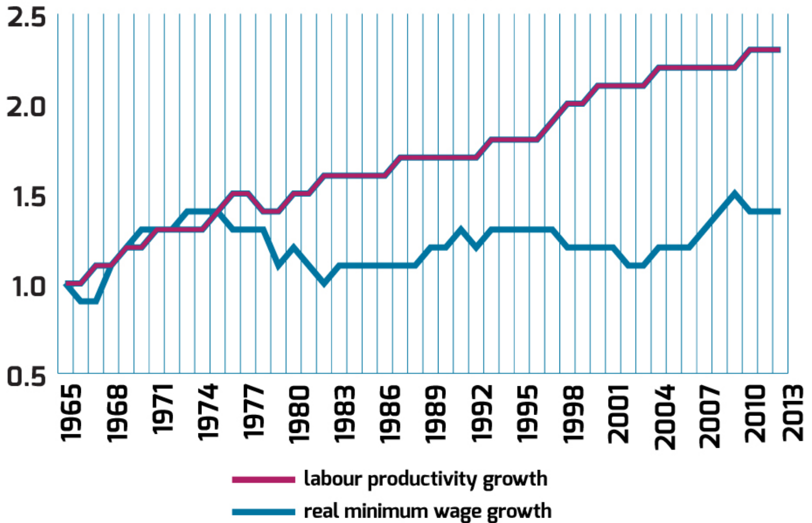
Cumulative growth: Canadian labour productivity and real Ontario minimum wage, 1965-2013